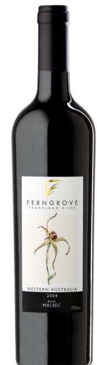
2005 King Malbec