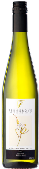
2007 Cossack Riesling