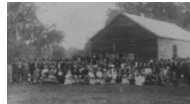
The Gordon Hall, c. 1923.