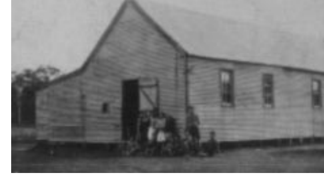
The Frankland Hall, c.1936.

In 1905 the people of Frankland built a hall on this site which became a central community facility and served as a school from 1912-1949.