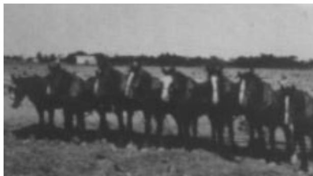
A team of dam-sinking horses at Gordon River, 1930.