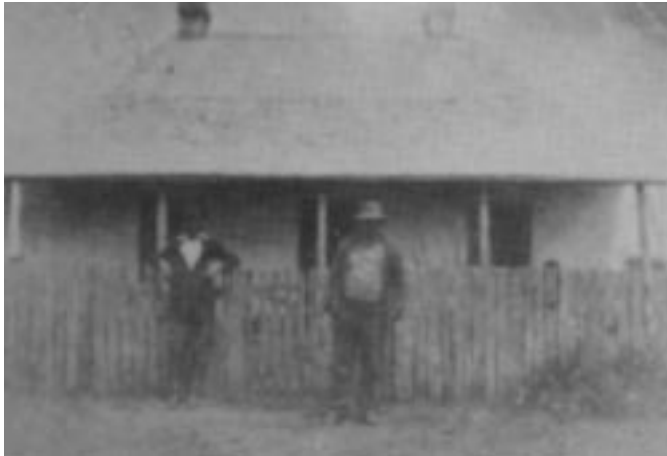
The old homestead at Wingebellup, 1919.