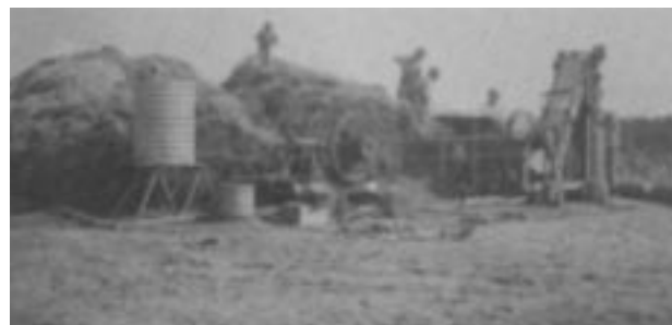
Chaff cutting in the Frankland district.

Very little evidence remains of the homestead, orchard, garden and farm buildings that were once located in this area which was resumed in 1949 by the Government. Part of the resumed land, including the area of the first settlement in Bokerup, was declared a reserve and the rest was opened up as either Conditional Purchase Blocks or Perpetual Lease Properties.