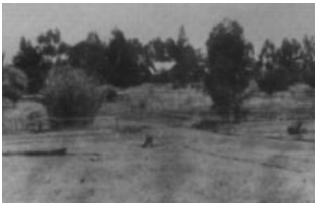
Yeriminup, c. 1905.